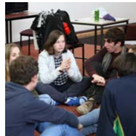
First consultation of the year, at Scotch College

Team of UN Youth WA volunteers who helped facilitate the WA elements of the Consultation.